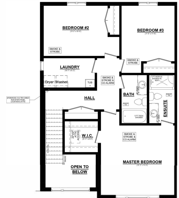
SEDONA 'B' UNIT #1 2ND FLOOR PLAN 966 SQ. FT. 8' CEILINGS ON 2ND FLOOR