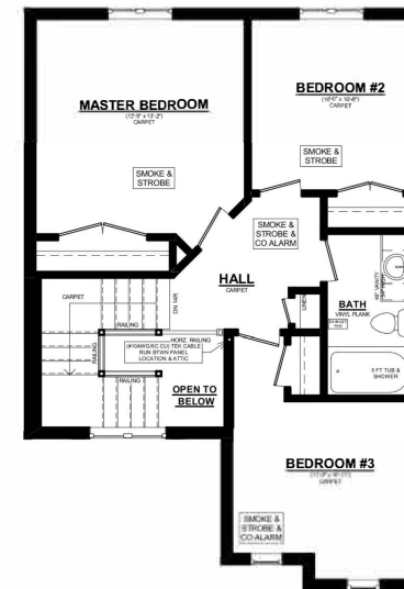
KENSINGTON B UNIT #1 2ND FLOOR PLAN 650 SQ. FT. 8' CEILINGS ON 2ND FLOOR