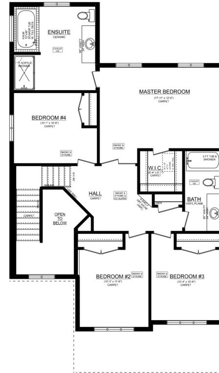
EDENBROOK 'A' 2ND FLOOR PLAN 1160 SQ. FT. (DOES NOT INCLUDE 134 SQ. FT. OPEN TO BELOW) 8" CEILINGS ON 2ND FLOOR