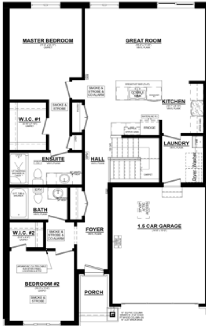
SUTHERLAND A UNIT #1 MAIN FLOOR PLAN 1300 SQ. FT. 8' CEILINGS ON MAIN FLOOR