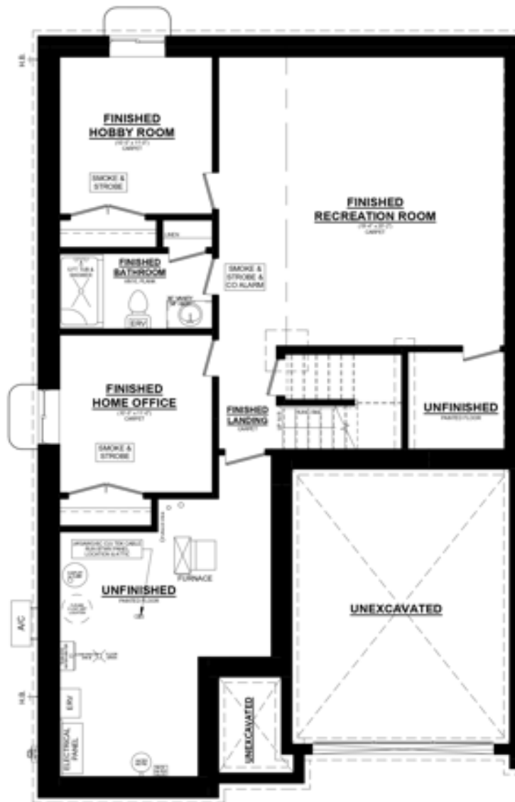
SUTHERLAND A UNIT #1 BASEMENT PLAN 741 SQ. FT. FINISHED BASEMENT SPACE