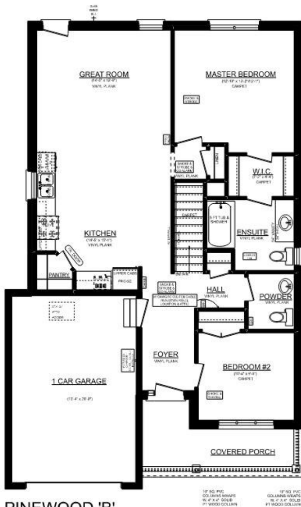
PINEWOOD 'B' MAINFLOOR PLAN 1100 SQ. FT. 8' CEILINGS ON MAINFLOOR