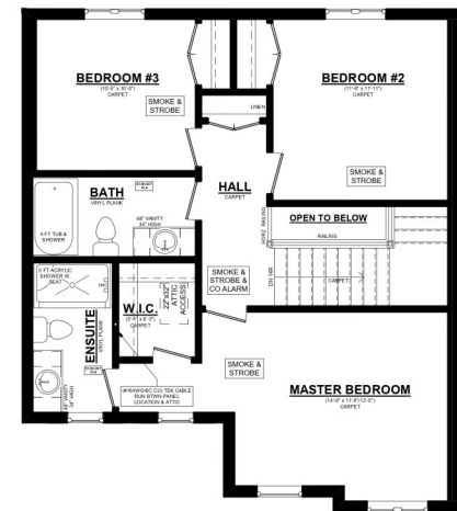
ELMWOOD C UNIT #1 2ND FLOOR PLAN 775 SQ. FT. 8" CEILINGS ON 2ND FLOOR