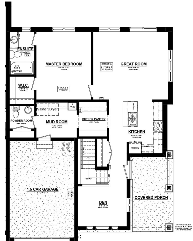
ROCKWOOD B UNIT #2 MAIN FLOOR PLAN 1066 SQ. FT. 8' CEILINGS ON MAIN FLOOR