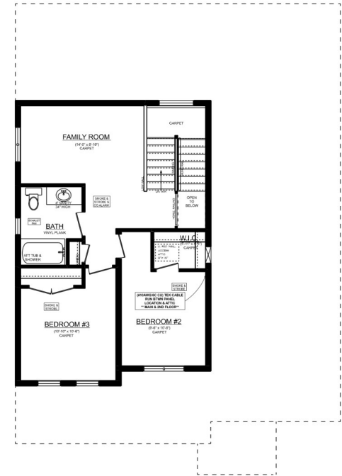
THE STONEHAVEN 'B' 2ND FLOOR PLAN 624 SQ. FT. (DOES NOT INCLUDE 76 SQ. FT. OPEN TO BELOW) 8' CEILINGS ON 2ND FLOOR