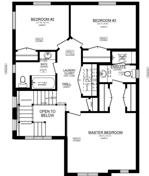
MAPLERIDGE 'A' 2ND FLOOR PLAN 925 SQ. FT. (DOES NOT INCLUDE 32 SQ. FT. OPEN TO BELOW) 8' CEILINGS ON 2ND FLOOR