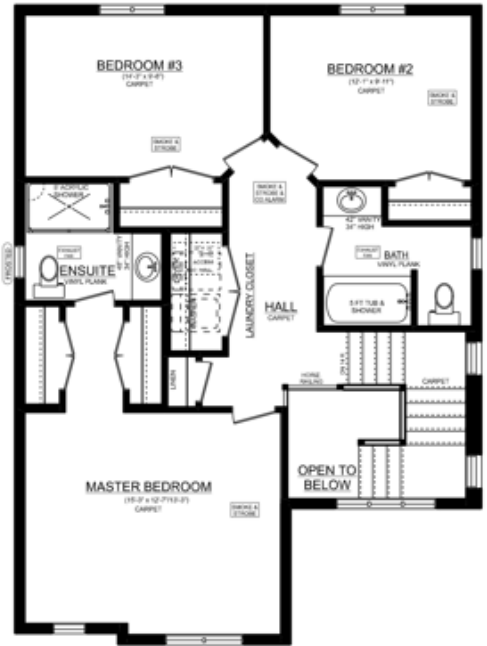
MAPLERIDGE 'A' 2ND FLOOR PLAN 871 SQ. FT. (DOES NOT INCLUDE 95 SQ.FT. OPEN TO BELOW) 8' CEILINGS ON 2ND FLOOR