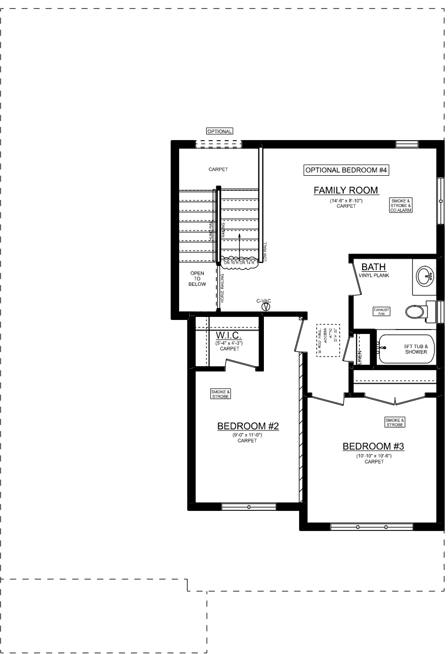
THE STONEHAVEN 'A' 2ND FLOOR PLAN 618 SQ. FT.

TO VIEW ADDITIONAL FLOOR PLAN OPTIONS VISIT OUR WEBSITE AT ( www.dougтарыhomes.com )