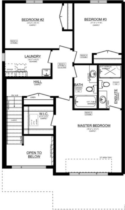
SEDONA 'B' UNIT #1 2ND FLOOR PLAN 8' CEILINGS ON 2ND FLOOR 963 SQ. FT. 79 SQ. FT. OPEN TO BELOW