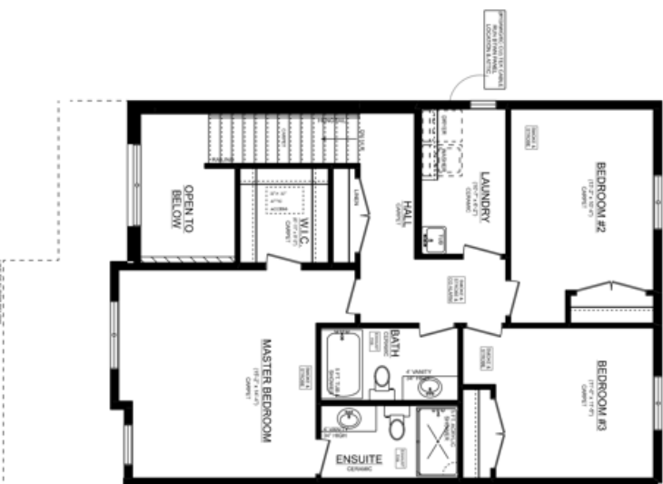
SEDONA 'A' UNIT #1 2ND FLOOR PLAN 8' CEILINGS ON 2ND FLOOR (DOES NOT INCLUDE 83 SQ. FT. OPEN TO BELOW)