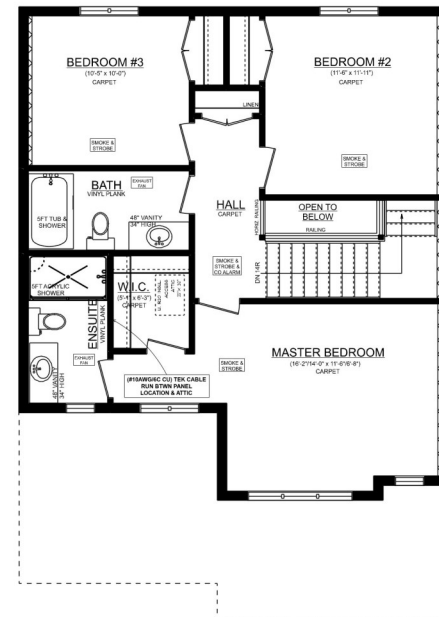
ELMWOOD 'B' UNIT #1 2ND FLOOR PLAN 8' CEILINGS ON 2ND FLOOR 775 SQ. FT. DOES NOT INCLUDE 75 SQ.FT OPEN TO BELOW