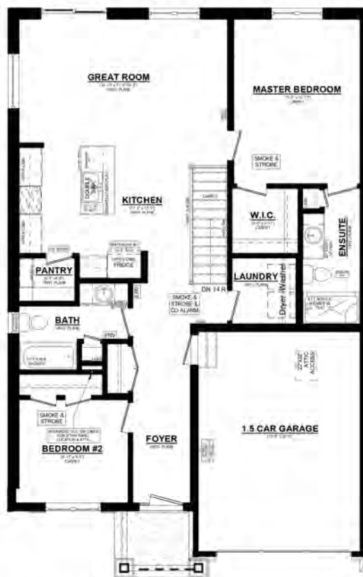
EASTON D UNIT #1 MAINFLOOR PLAN 1200 SQ. FT. 8' CEILINGS ON MAINFLOOR