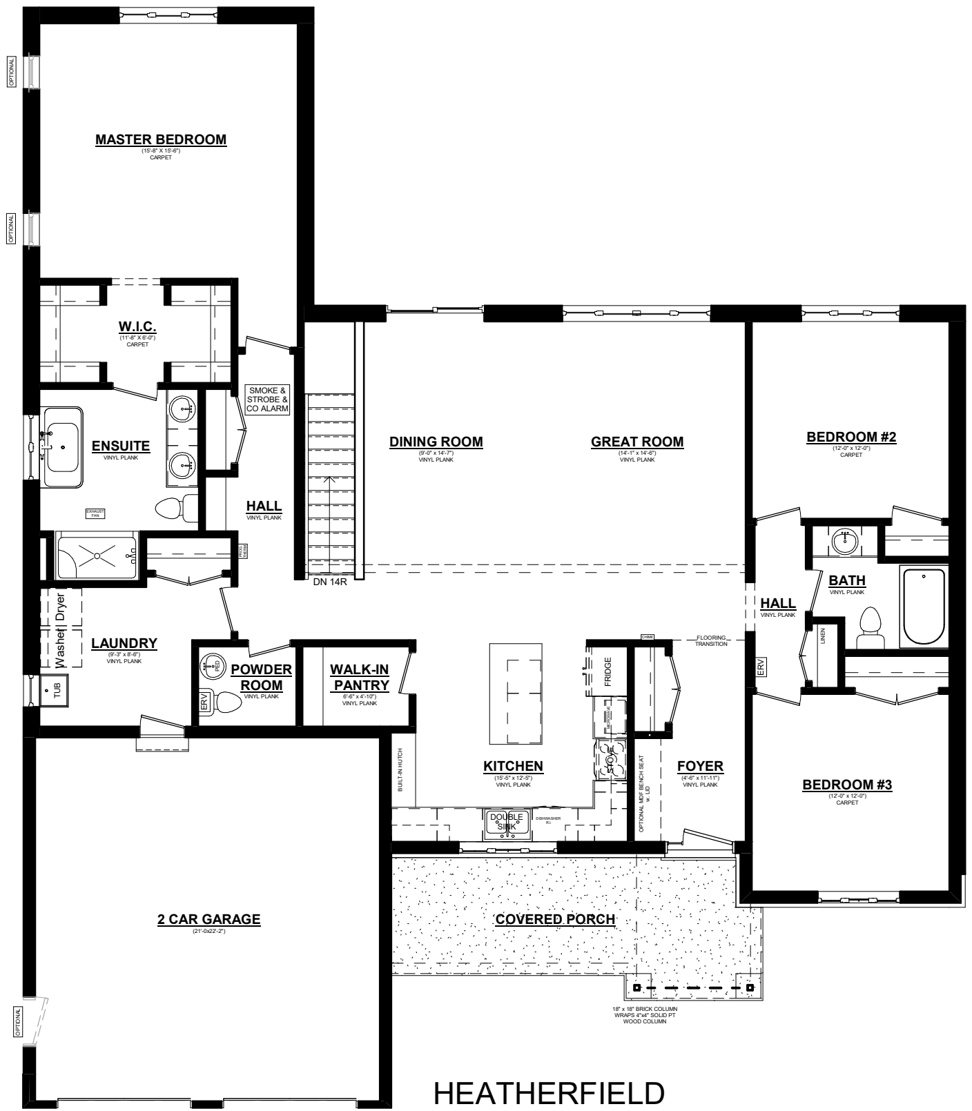
HEATHERFIELD MAINFLOOR PLAN 2094 SQ. FT. 9' CEILINGS ON MAINFLOOR

TO VIEW ADDITIONAL FLOOR PLAN OPTIONS VISIT OUR WEBSITE AT ( www.dougarryhomes.com )