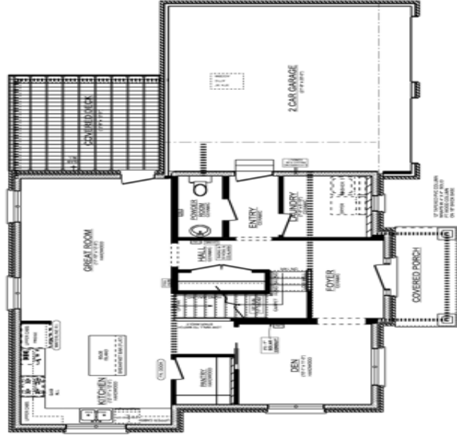
CAROLINIAN 'A' MAIN FLOOR PLAN 968 SQ. FT. 8' CEILINGS ON MAIN FLOOR