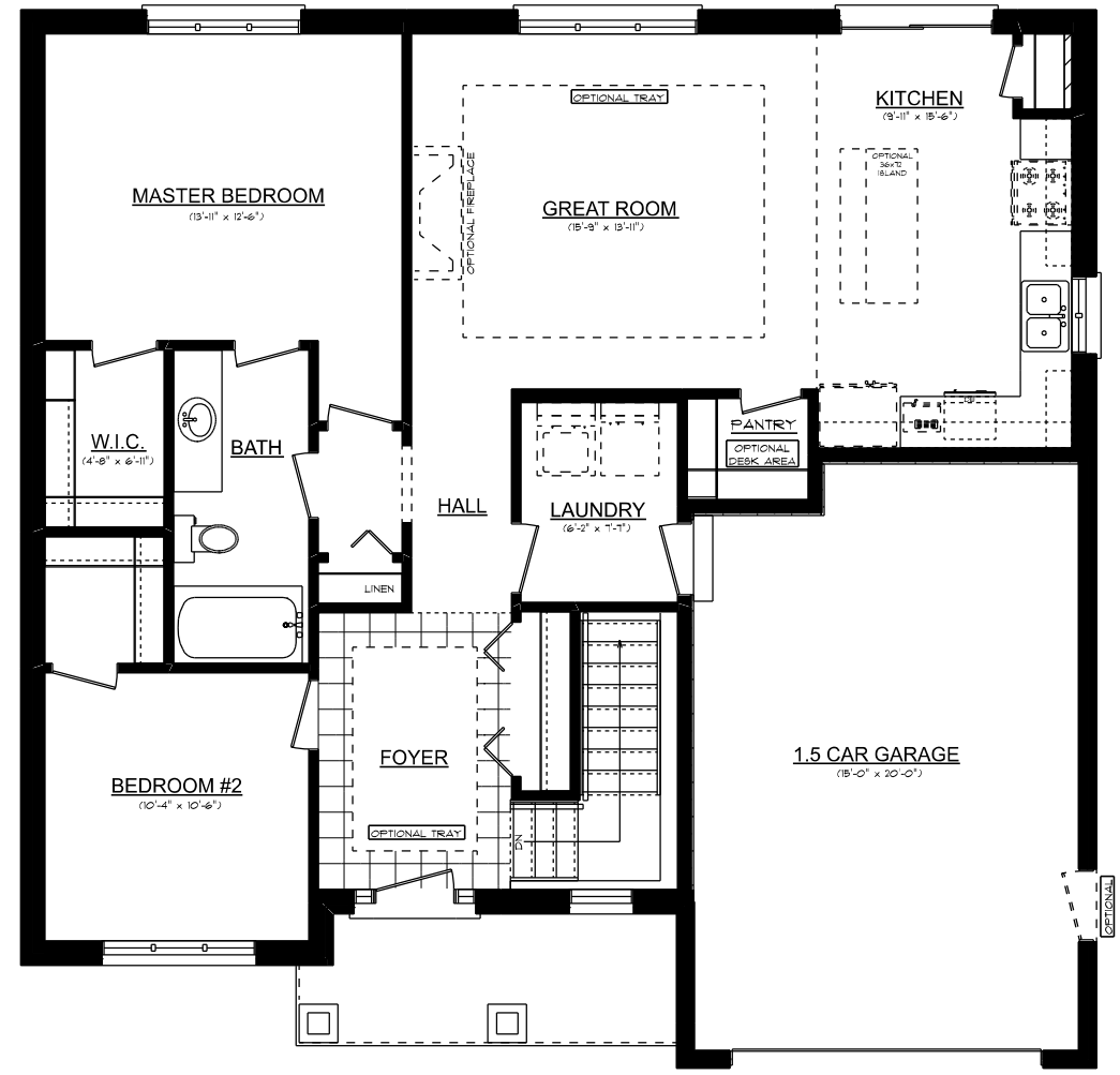
THE KNOLLWOOD MAIN FLOOR PLAN 1226 SQ.FT. 8' CEILINGS ON MAINFLOOR