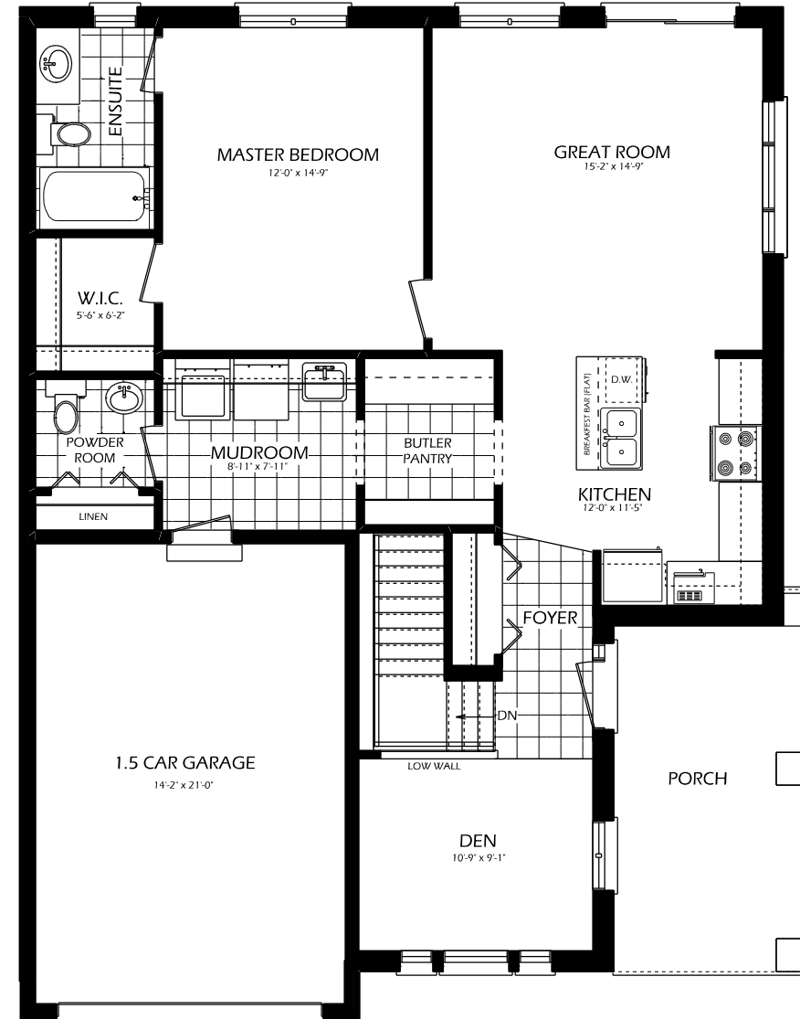
MAIN FLOOR 1111 SQ. FT. 8' CEILINGS ON MAINFLOOR

TO VIEW ADDITIONAL FLOOR PLAN OPTIONS VISIT OUR WEBSITE AT ( www.dougarryhomes.com )