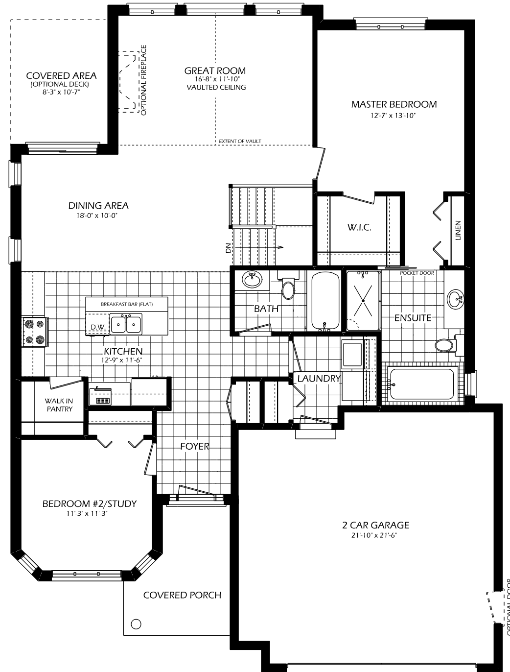
MAIN FLOOR 1498 SQ.FT.