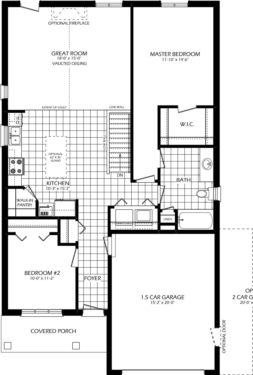
MAIN FLOOR 1276 SQ. FT. 8' CEILINGS (ON MAIN FLOOR)